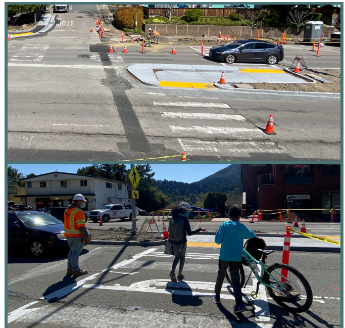
A new HAWK beacon will be installed at the Ash Avenue pedestrian crossing (pictured above) in May 2021.

Other upcoming construction activity includes water pipe line work, traffic signal replacement/synchronization, road repaving, construction of retaining walls and utility work over the next couple of months.